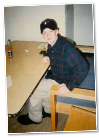
My first semester of college