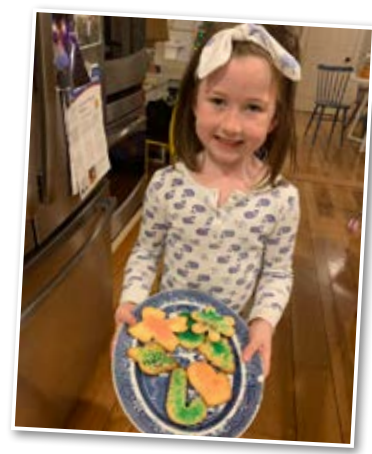
My kids absolutely love these cookies!

don't have a season, so they are always appropriate!