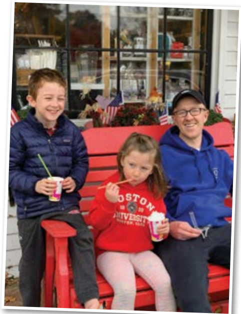
We've moved to the suburbs and are making new memories as a family.

But looking back, we made the right call. Our family loved our time living in