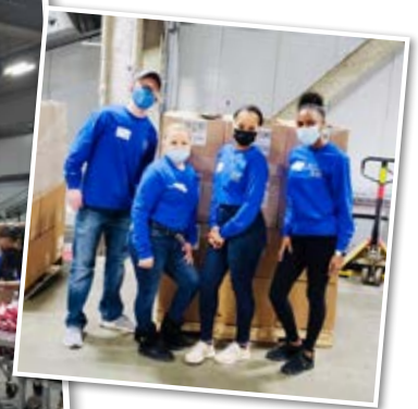
Our team recently took a Friday off to volunteer at the GBFB.

They are a well-oiled machine that focuses on distributing healthy food to those who need it in eastern Massachusetts.