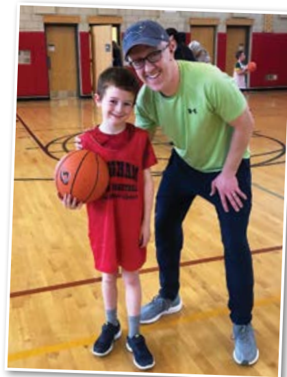
I love coaching my son's baseball and basketball teams.

Second, it further bonds my son and I. It allows us to spend extra time together on the weekends. He's growing up so fast and coaching allows me to be even more involved in his life. I guess I am still 'cool' to him, for now at least, but those days are numbered. Why do they have to grow up so fast!?